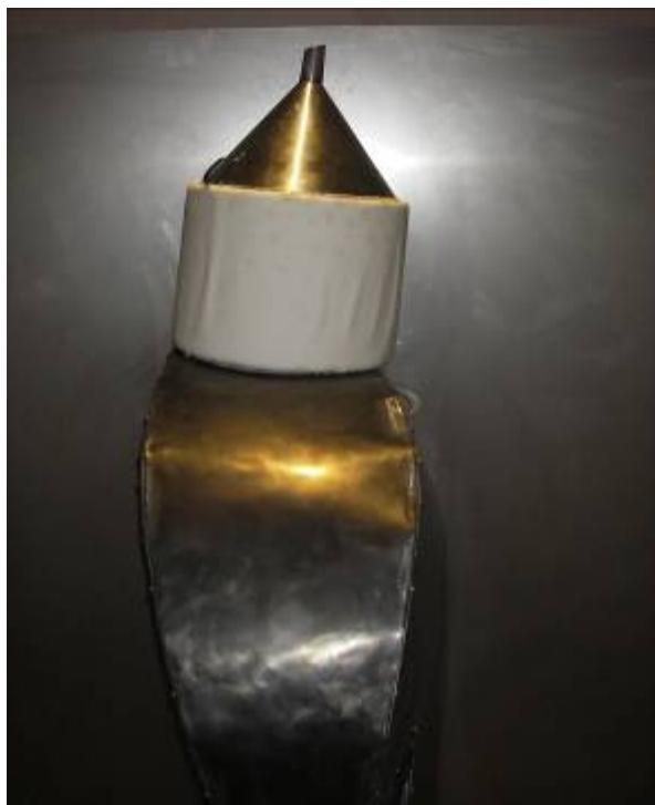
Figure 3: The 2 nd (side-on) point of perception where the viewer will have no awareness of the Planes of (non) Existence. The viewer only perceives the Cyborg.