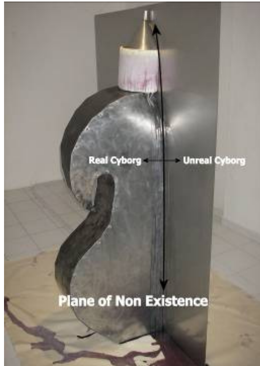
Figure 4: The 4 th (angle-on) point of perception where the viewer engages the Plane of Non Existence, allowing the viewer to perceive the real and unreal Cyborg. This point of perception will be placed somewhere between the 1 st and 2 nd points of perception (Fig. 1). Here there is no perception of the Plane of Existence.