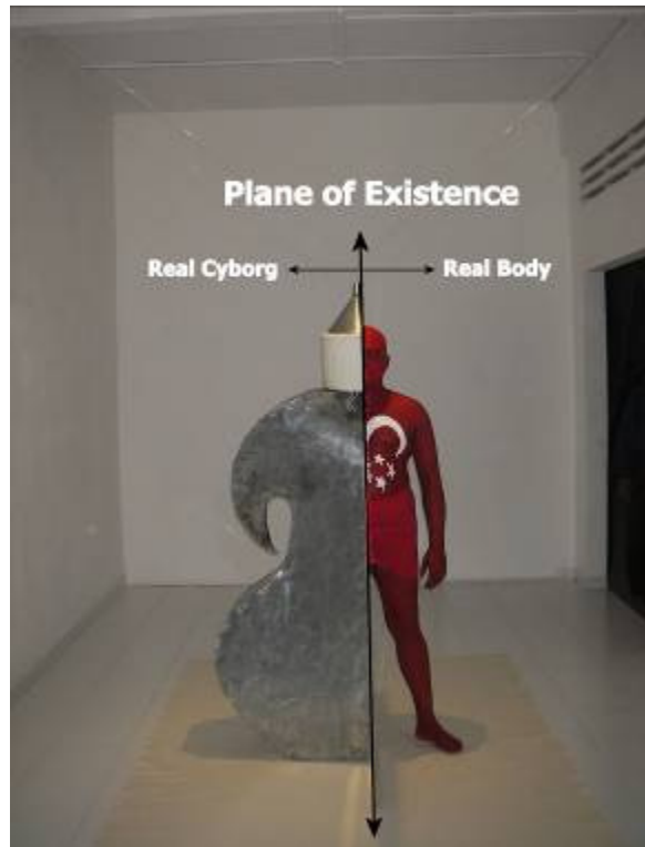
Figure 2: The 1 st (front-on) point of perception that only allows the viewer to engage with the Plane of Existence. The viewer perceives the real Body and the real Cyborg.