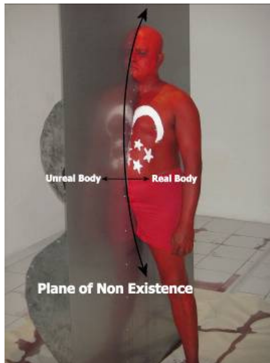
Figure 5: The 5 th (angle-on) point of perception where the viewer engages the Plane of Non Existence, allowing the viewer to perceive the real and unreal Body. This point of perception will be placed somewhere between the 1 st and 2 nd points of perception (Fig. 1). Here the viewer also perceives of the Plane of Existence, as the real Cyborg is also perceived.